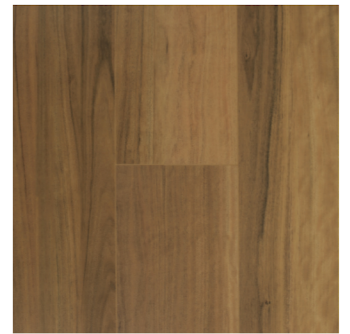
QLD Spotted Gum